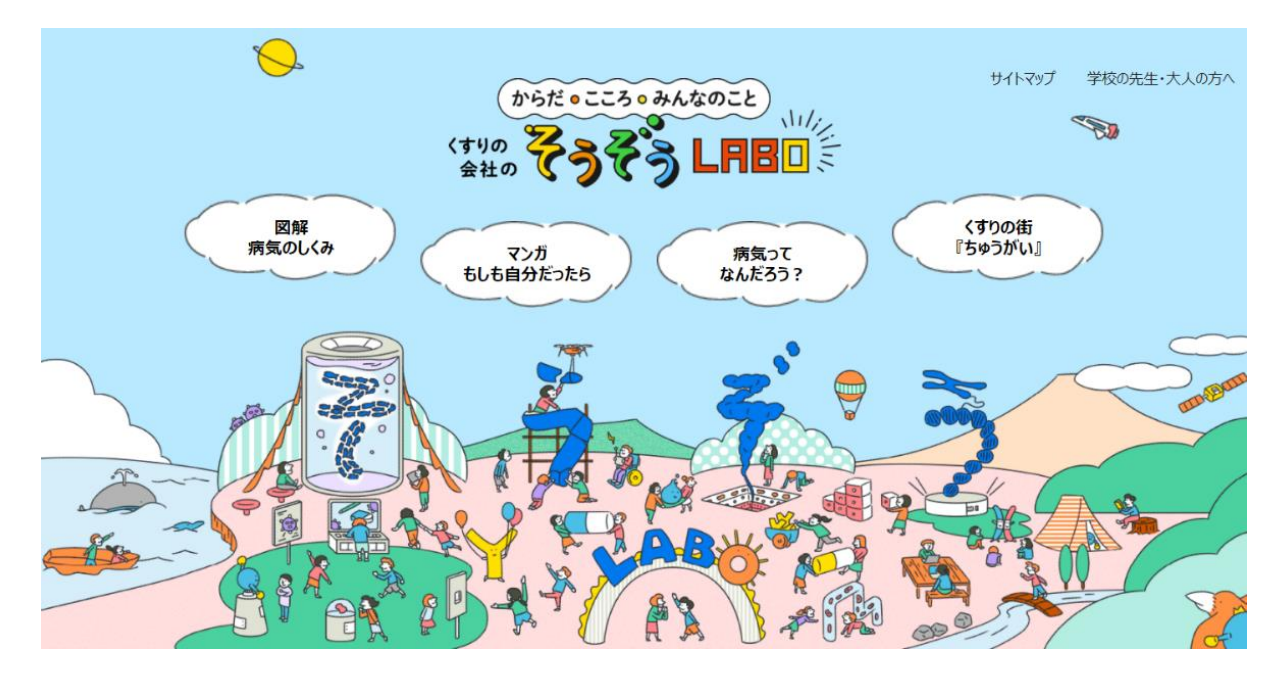
https://www.chugai-pharm.co.jp/kids/ (in Japanese only)

TOKYO, December 1, 2021 -- <u>Chugai Pharmaceutical Co., Ltd.</u> (TOKYO: 4519) announced that the company has launched an educational website for kids "So-Zo LABO by a Pharmaceutical Company for the Body, Mind, and Everyone" (hereafter, "So-Zo LABO") to ensure that children understand about diseases correctly, imagine the feelings of those who have the illness, and create a healthy society that embraces the diversity.